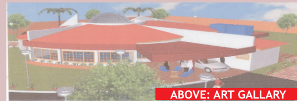
ABOVE: ART GALLERY

Gifts of appreciated securities, such as stocks, bonds or mutual funds are deemed acceptable to the University.